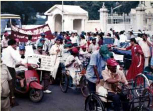
Safety Awareness Rally